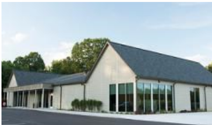
Coolspring Branch of the La Porte Co. Public Library

CE is free of charge as part of your membership benefits. A light lunch will also be provided to all attendees! CE is $40 for non-members.